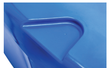
Flats for Connections