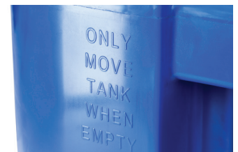
Moulded in Safe Handling Instructions